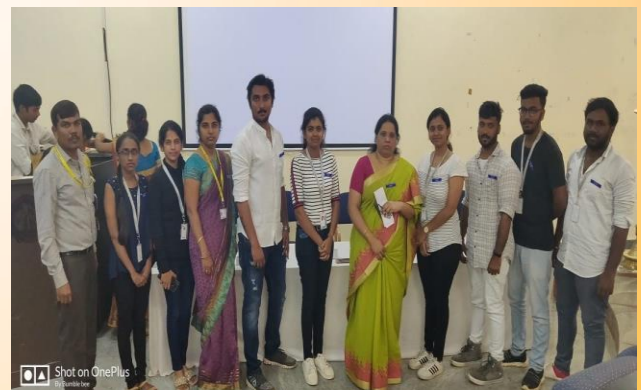
All the office bearers of ECE Department Association