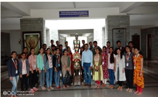
Students at VTU regional centre for workshop on Aerospace