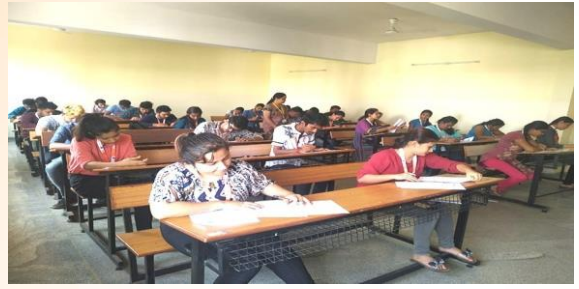
3 days workshop on “3 D Experience platform in Aerospace” in association with COE ,A&D, Dasault system on 24,30 Oct.2019

Objective test was conducted on 16/10/19 in association with live wire ,to provide 16 hrs free training for topper from the test.