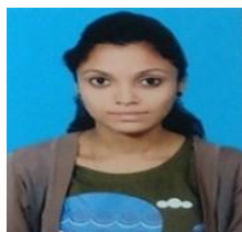
BRUNDA N 1RI15EC010 SGPA 9.5